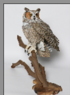
I can't believe it was carved from wood!